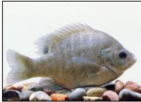
Figure 3. Bluegill make excellent continuous forage for bass.

Transferred fry are more uniform in size if individual schools are seined. All fry should be the same age, as nearly as possible, because fingerlings become cannibalistic at about 2 inches in length. There-